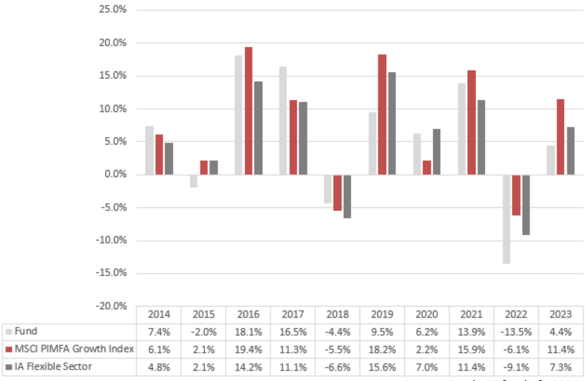
Evelyn MM Global Investment Fund Class B Income Share