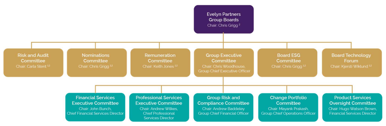
Figure 3 The governance structure encompassing the Board, its principal Board Committees and sub-Committees.

The role and responsibilities of the Board and Board Committees, including sub-Committees, are set out in formal Terms of Reference to ensure there are clear lines of accountability and responsibility to support effective decision-making across the organisation. These are reviewed at least annually as part of the review of the corporate governance framework.