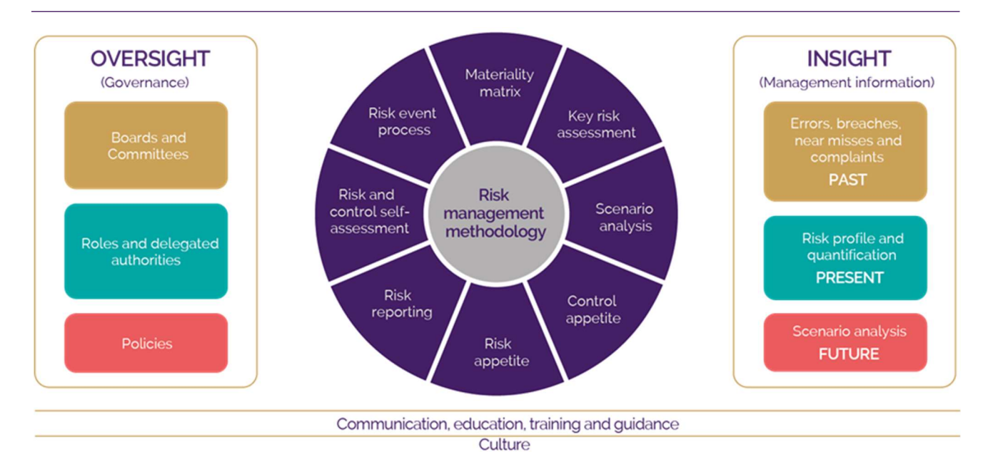
Systems and tools